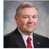
HIGHEST-RATED REPUBLICAN Sen. William Sharer (SD-01) | 72%