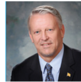
LOWEST-RATED REPUBLICAN Sen. Sander Rue (SD-23) | 31%